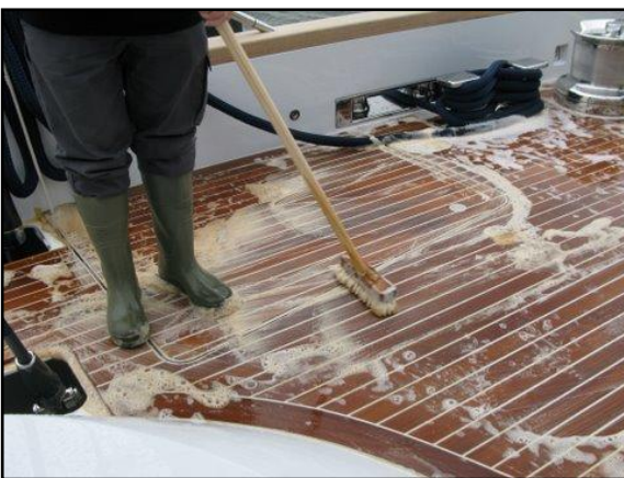
Clean with a soft brush or broom