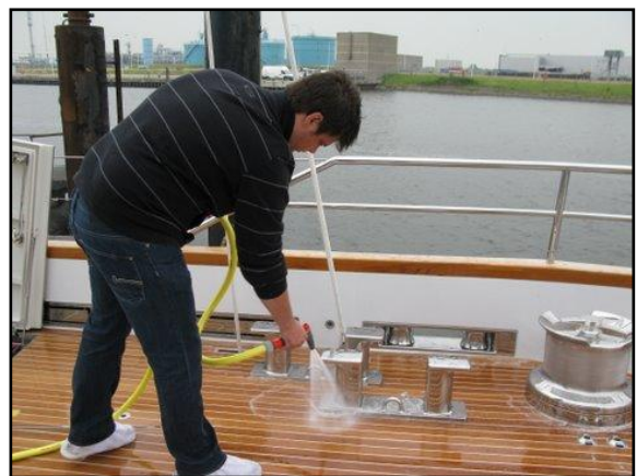
Remove the cleaner with (salt) water